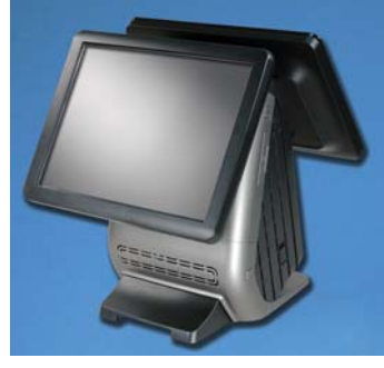
Optional Integrated 15" LCD Customer Display