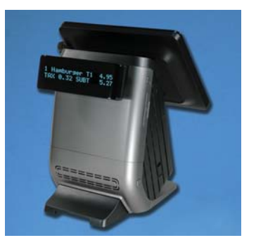
Optional Integrated VFD Customer Display