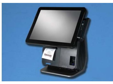
Card Reader / Printer / Fingerprint Reader