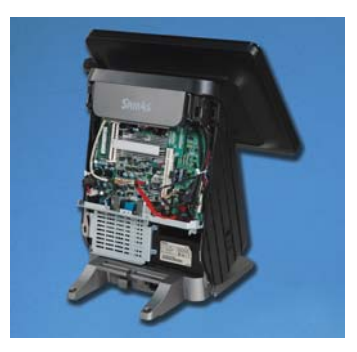
Tool-Free Entry to Access RAM and Hard Disk Drive Simplifies Serviceability