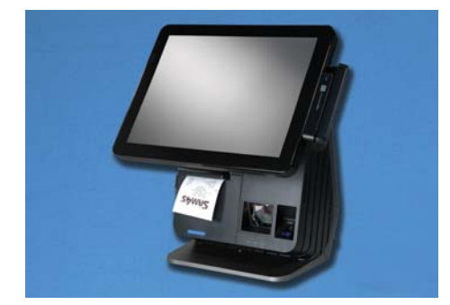
Card Reader / Printer / Scanner + Fingerprint Reader