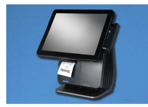
Card Reader / Printer